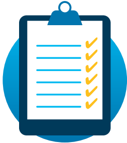
Public Policy User