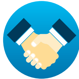
National Or Local Public Client/ Procurer User