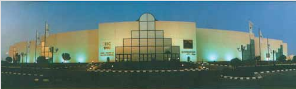
JCFE Jeddah Centre for Forums & Events ( Owned by J.C.C.I. )

Established, developed and owned by the Jeddah Chamber of Commerce, the purpose-built Jeddah Centre for Forums & Events offers services to the highest international standards.