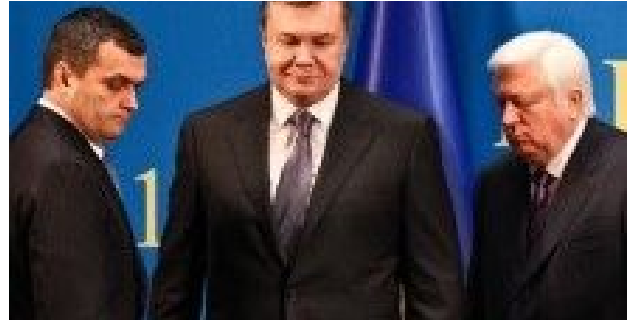
Lutsenko vows seizure in 2018 of another UAH 5 bln stolen by Yanukovich team