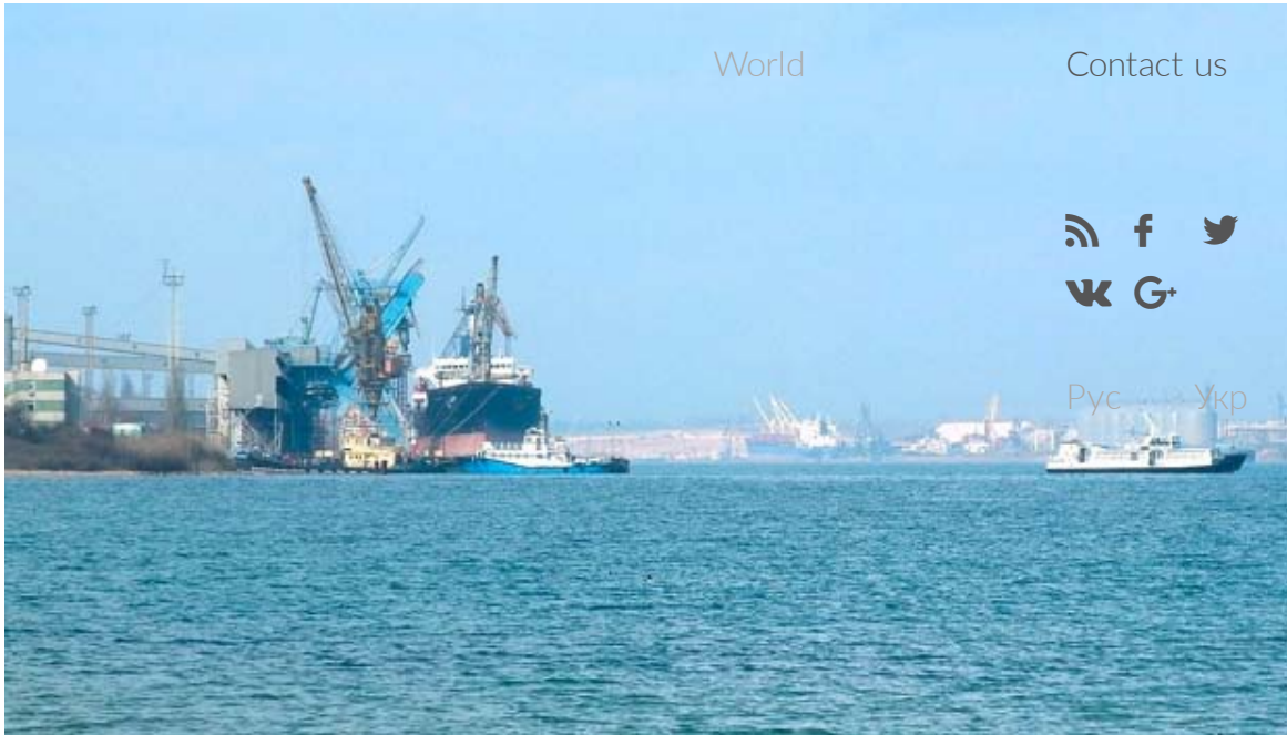
Yuzhny Port

The Ukrainian Sea Ports Authority (USPA) on Tuesday has issued a tender for the dredging works at two Ukrainian Azov Sea ports, according to Xinhua.