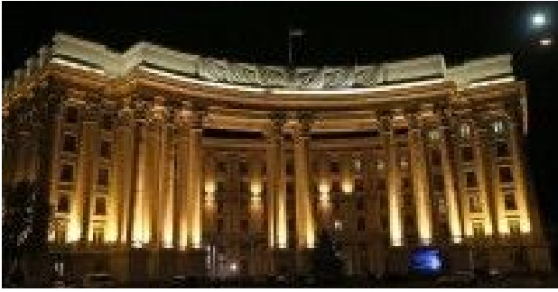
Ukraine to file more suits against Russia in The Hague – MFA